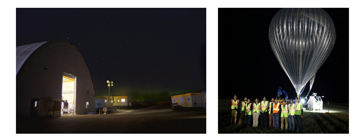
Figure 3. HiCIBaS payload was tested several times before flight, including at the launch base (left). HiCIBaS' Canadian and Dutch teams in front of the gondola with auxiliary balloon on the runway right before launch (right).