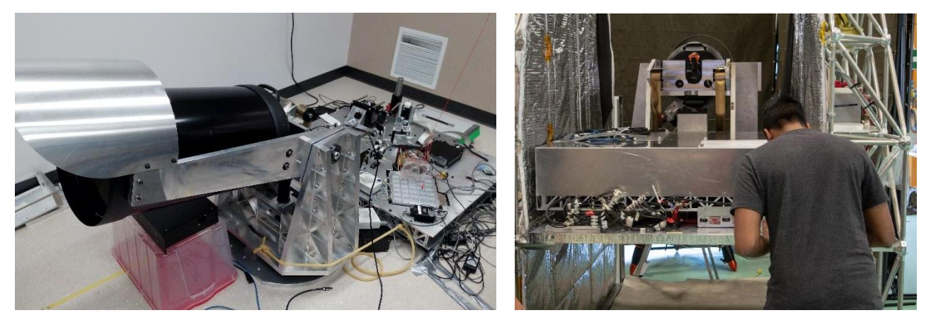
Figure 1. HiCIBaS payload in the laboratory (left) and integrated in the gondola (right)

launched from Timmins Stratospheric Balloon Base on August 25<sup>th</sup>, 2018 at 11:18 pm. The flight onboard the CNES gondola CARMEN provided 6.8 h of nighttime flight at an altitude of approximately 37 km. HiCIBaS was one of the seven experiments included in that flight.